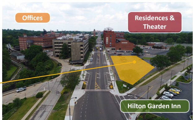
THE BANK - RESTAURANT SPACE 8,000 - 10,000 Sq. Ft. Available